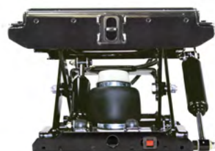
Double Damper View