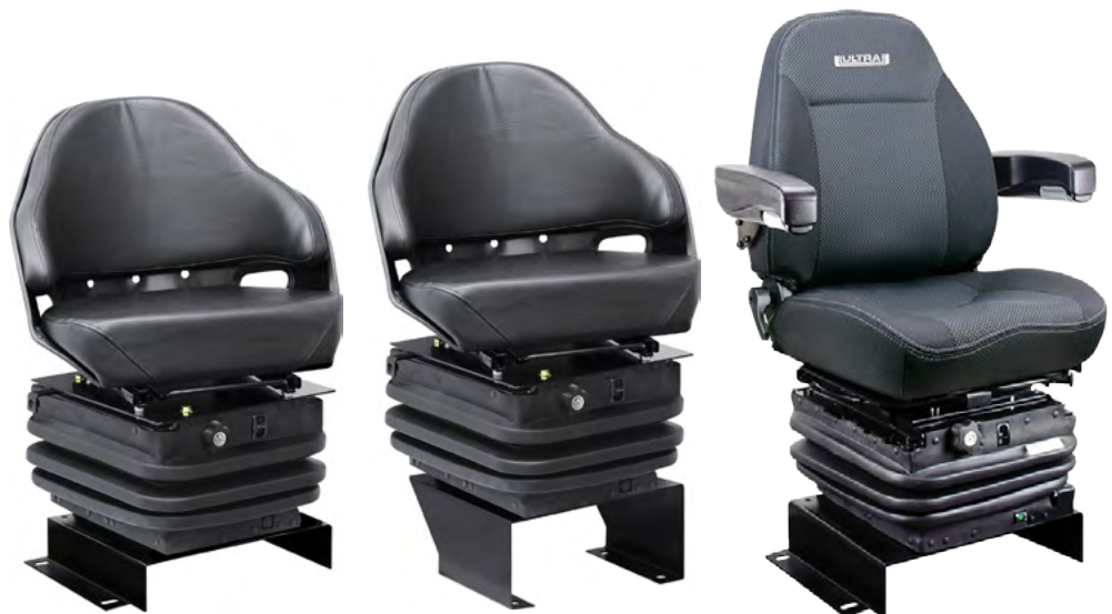
M678SC Medium Base