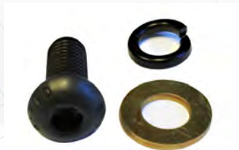
1 Bolt, 1 Lock Washer and 1 Flat Washer

Remove the plastic covers on each side of the seat.